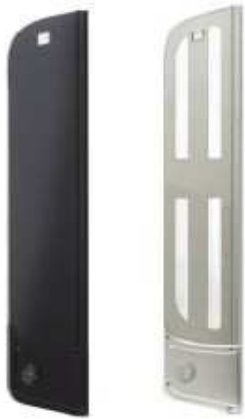
Variety of Styles Available

Diamond Door Guard is a feature rich Electronic Article Surveillance system compatible with all 58Khz acousto-magnetic tags and labels.